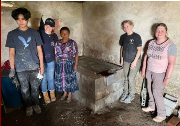
Standing by a completed stove

¡Hola! I spent a week in rural Guatemala with members of Old Bridge UMC in Woodbridge, Virginia. We spent three days building stoves in the highlands in order to provide families with a safer alternative to the fires that they had been using to cook. On Thursday we spent the morning volunteering at a local school assisting kids with Mayan art and math projects. On Friday we spent time exploring Antigua.