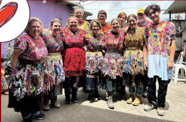
A team photo in traditional Guatemalan clothes