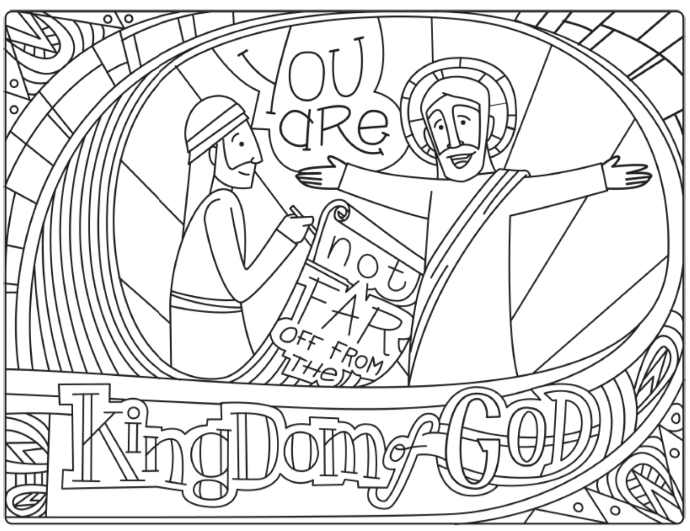
Mark 12:28-34 • illustratedchildrensministry.com