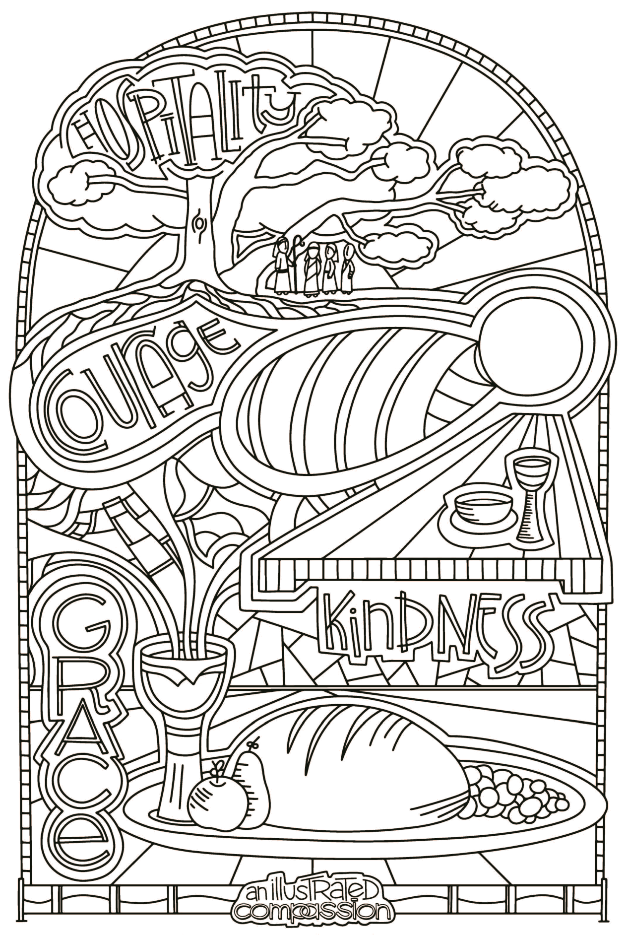
@ \ 2017 \ Illustrated \ Children's \ Ministry, LLC. \ All \ rights \ reserved. \ illustrated \ childrens \ ministry, com