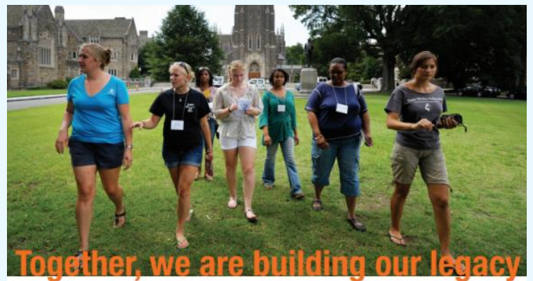
Together, we are building our legacy

Berea UMW recently donated $150 to the Legacy Fund. Our offering will help provide compassionate care and support that heals, empowers, and restores the lives of women, children, and youth for years to come.