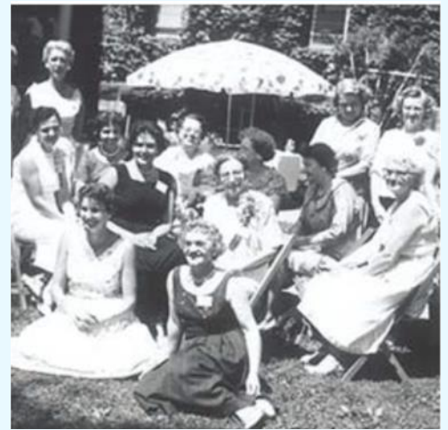
Ladies Auxiliary 1937

In 1864, the German Methodist Orphan Asylum was founded as a home for orphans whose fathers had died in the Civil War or in the sandstone quarries. By 1903, 3 buildings housed over 500 children from 16 states. The orphans were taught life skills, given chores to do, and escorted to church. In 1928, children were grouped in cottages; they attended public school, church and lived with “house parents.”