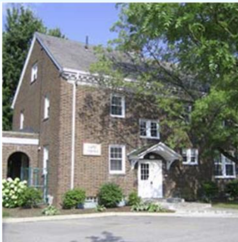
First girl's residential cottage, 1984

The Ladies Auxiliary (1930s) secured donations from the community to help make a positive difference in the lives of the children. The Methodist Children’s Home, named in 1937, reflected the addition of troubled children with parents.