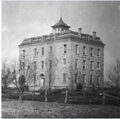
German Methodist Orphan Asylum, 1874