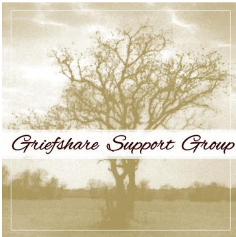
Griefshare Support Group