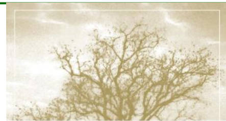
Griefshare Support Group