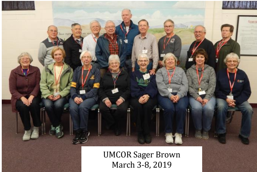
UMCOR Sager Brown March 3-8, 2019

Missions accomplished: certifying school bags - upgrading electrical fixtures with LED bulbs - packing certified school bags for shipping - telephone calls to remind adults to recertify for food assistance - shelling pecans for support of senior center - playing bingo at senior center - sewing and repairing school bags - certifying flood buckets - meal time kitchen duty.