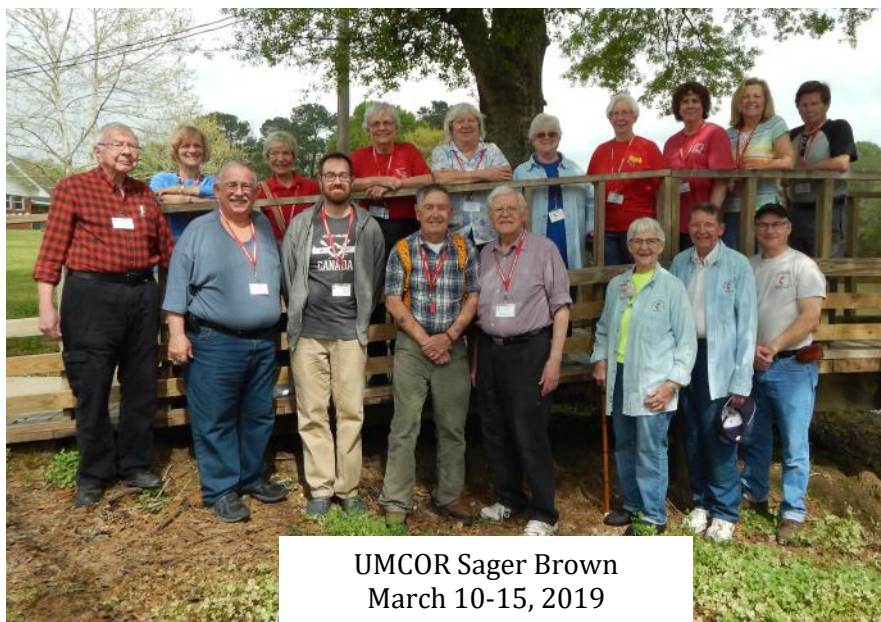
UMCOR Sager Brown March 10-15, 2019